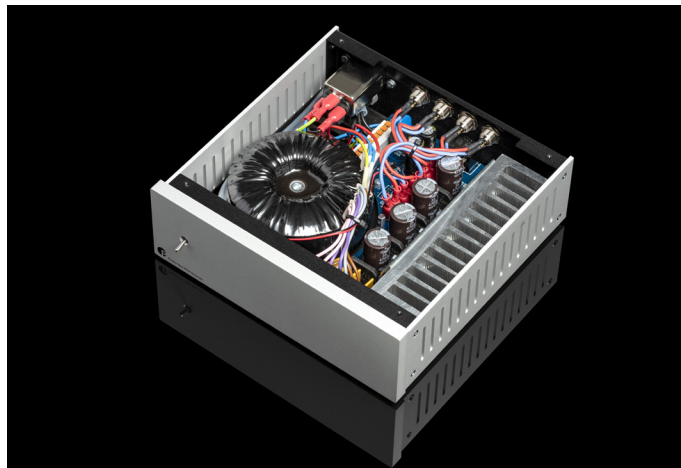
Separately available upgrade power supply: Power Box RS2 Sources

The Power Box RS2 Sources is a linear power supply which is available separately and would be another step up for your CD Box RS2 Tube's performance. It is a proven fact that a power supply is a very important part of the audio path and significantly contributes to the sonic quality of an audio product. Sound staging, darkness of silent backgrounds and small detail resolution will improve strongly and contribute to a far better overall performance.